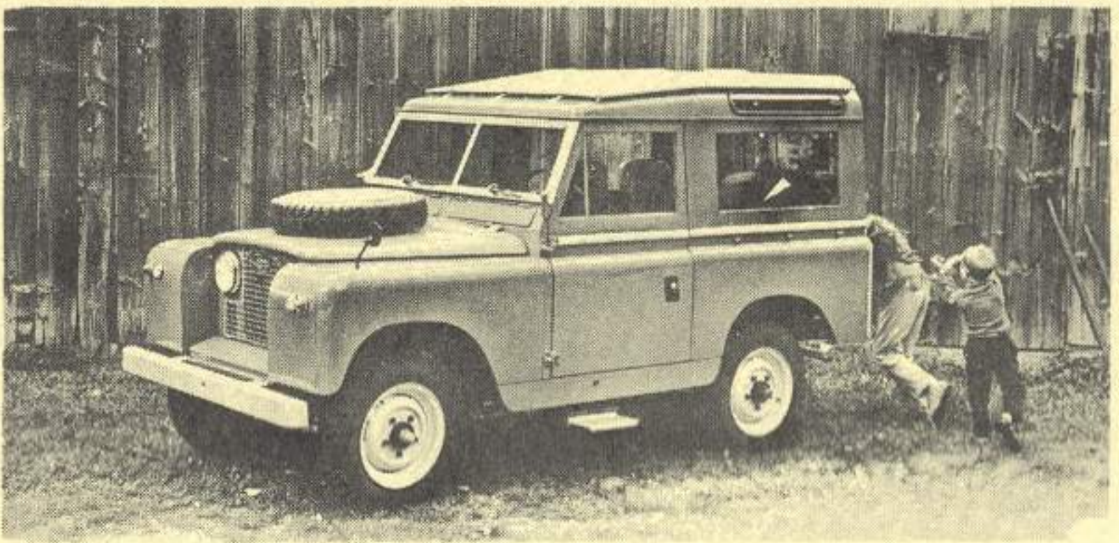
LAND-ROVER STATION WAGON 88" wheelbase, 7 passenger